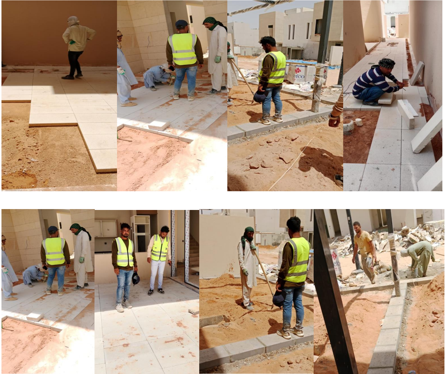
ROSHAN HOUSING VILLA PROJCT AIRPORT- RIYADH

شركة الترا الحديثة المحدودة ULTRA MODERN Co. Ltd.